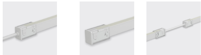
TOP END FEED END CAP 300MM FLEXIBLE CONNECTOR

FITTING ON-SITE - WHERE LENGTHS ARE UNKNOWN IN ADVANCE. MUST BE FITTED CORRECTLY FOR IP RATING