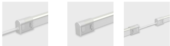
TOP END FEED END CAP 300MM FLEXIBLE CONNECTOR

FITTING ON-SITE - WHERE LENGTHS ARE UNKNOWN IN ADVANCE. MUST BE FITTED CORRECTLY FOR IP RATING