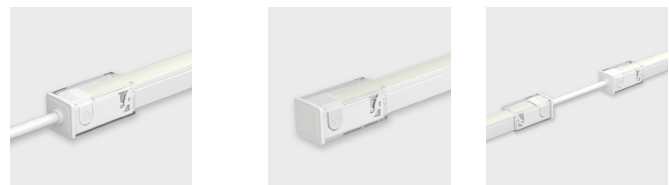
TOP END FEED END CAP 300MM FLEXIBLE CONNECTOR

FITTING ON-SITE - WHERE LENGTHS ARE UNKNOWN IN ADVANCE. MUST BE FITTED CORRECTLY FOR IP RATING