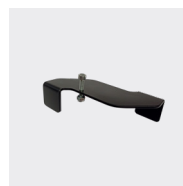
LOWLINE 05 MOUNTING CLIP