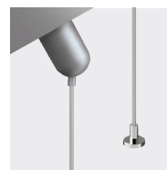
ANGLED SUSPENSION WIRE