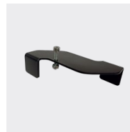
HIGHLINE 03 MOUNTING CLIP