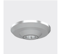
CABLE BASE MINI 38MM Ø35MM