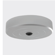
CABLE BASE SURFACE MOUNT Ø80 × H22MM

X = (A) ANODISED, (B) BLACK OR (W) WHITE