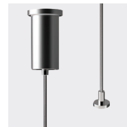
SUSPENSION WIRE WITH BASE