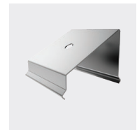
BASELINE 02 45° MOUNTING CLIP