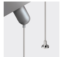
ANGLED SUSPENSION WIRE