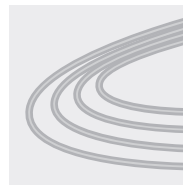
CLEAR FLEX CABLE