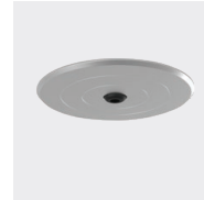
CABLE BASE RECESS MOUNT Ø80 × H20MM (3mm exposed)