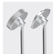
ADJUSTABLE ROD SUSPENSION