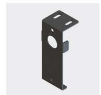
90MM LINEAR WALL MOUNT CLIP