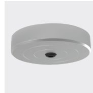
CABLE BASE SURFACE MOUNT Ø80 × H22MM

X = (A) ANODISED, (B) BLACK OR (W) WHITE