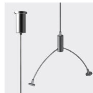
Y SUSPENSION WIRE WITH BASE