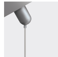
ANGLED SUSPENSION WIRE