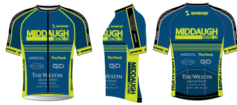
MEN'S AND WOMEN'S S/S BIKE JERSEY