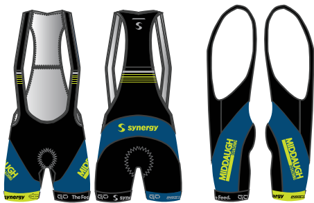
MEN'S BIB SHORT