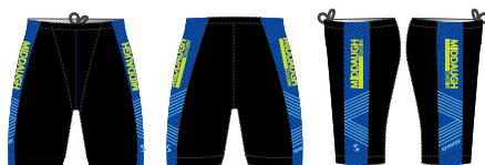
WOMEN'S RACE TRI SHORT