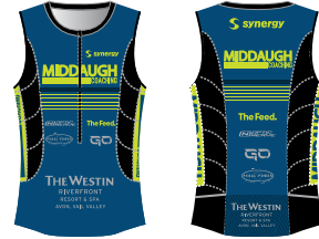
MEN'S ELITE TOP