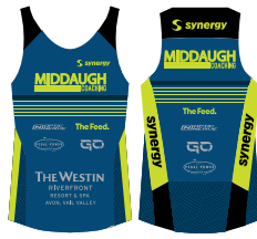
WOMEN'S ELITE TOP