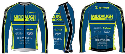
MEN'S AND WOMEN'S L/S BIKE JERSEY