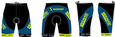
MEN'S AND WOMEN'S BIKE SHORT