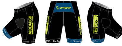
MEN'S ELITE TRI SHORT