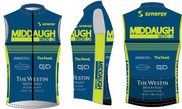
MEN'S AND WOMEN'S BIKE VEST