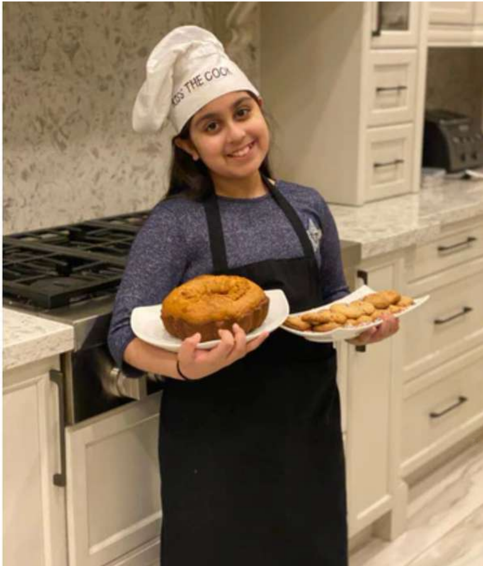
AMAYA Professional Baker

100% spun polyester aprons with bib style or 4-way square designs – perfect for protecting clothing from everyday messes! Also available in poly/cotton 65/35 fabric in duck quality. you're sure to find exactly what you need for a professional set of kitchen linens.