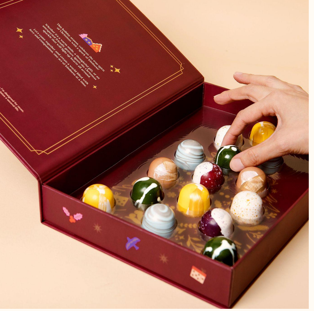
*Prices shown are exclusive of GST. Images are for illustration purposes only.