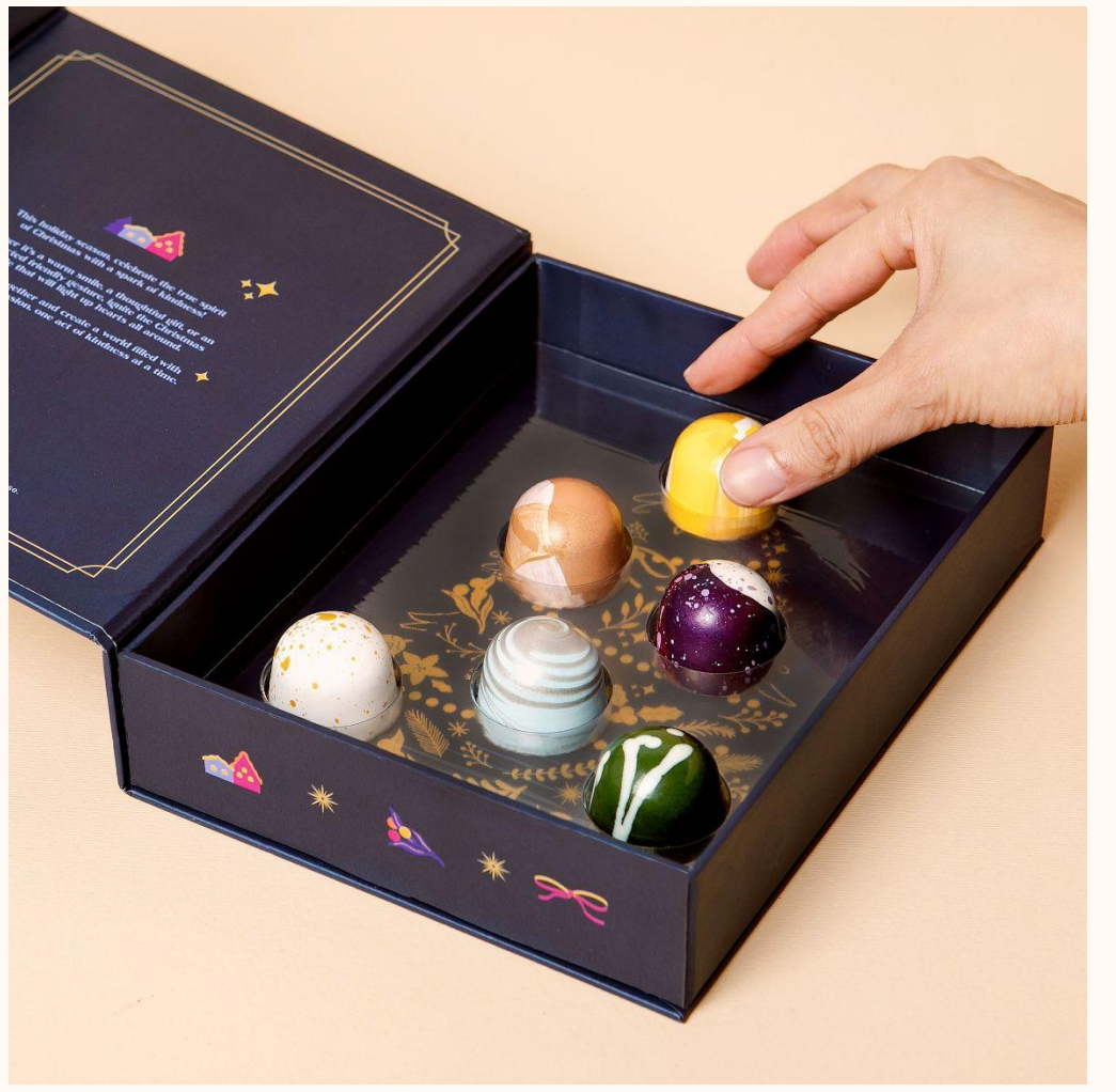
*Prices shown are exclusive of GST. Images are for illustration purposes only.