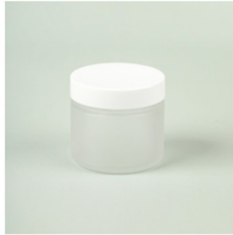
2oz Frosted Glass with White Lined Smooth Cap