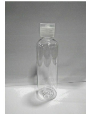
2oz and 4oz PET Clear Bottle with Natural Flip Cap