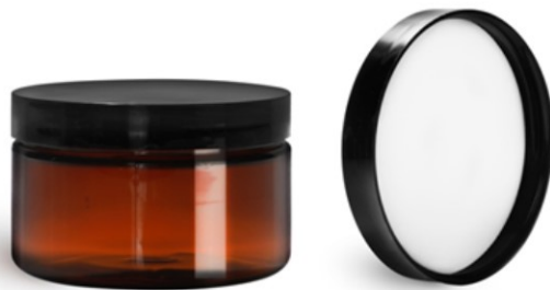
2oz Amber PET with Smooth Lined Cap