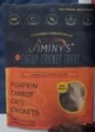
Cricket flour pumps up the protein in these dog treats.

"Just one bag of our treats saves about 220 gallons of water compared with a bag of beef treats," Anne notes. And switching one dog from a chicken-based diet to a cricket-based one saves nearly half a million gallons of water a year, says Anne. "With 89 million dogs in the U.S. currently consuming 32 billion pounds of protein, this is a place where a company can make a big impact." jiminy.com