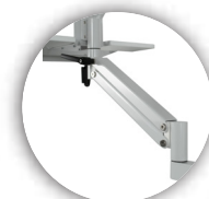
Arm for adjustability