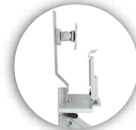
Workstation Fold Away Capability