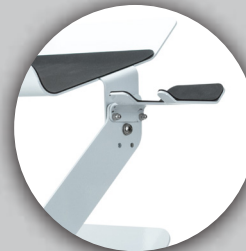
Wireless Scanner Holder