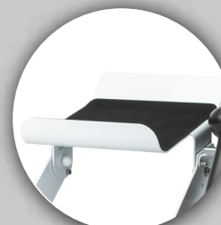
Padded rubber support