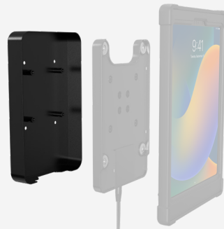
for CTA Digital's Inductive Charging Cases