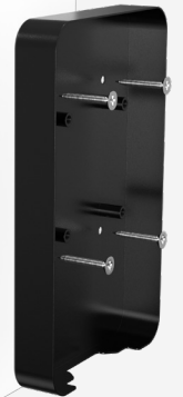
VESA WALL MOUNT 75mm X 75mm