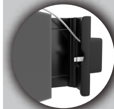
Adjustable Rubber Component for Cable Security