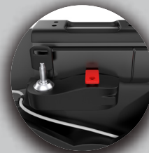
Anti-Theft Tablet Security