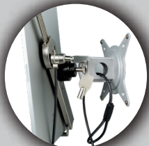
Security Anchor for VESA Mount