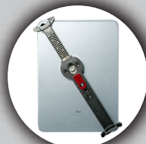
Security Grip Holder