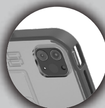
Full Port Access