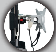
Security cable anchors to Vesa Mount