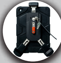
Tri-grip Security Clasp Holder