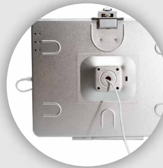
Optional In-Wall Cable Routing