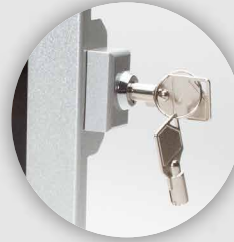
Locking Case with Keys