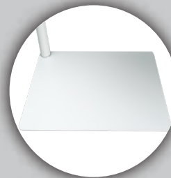
Matte White Surface Plane