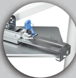
Lock & Key Security Holder