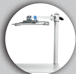
Height Adjustable Arm