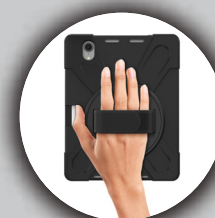
Comfortable Hand-Strap for Handheld Mode