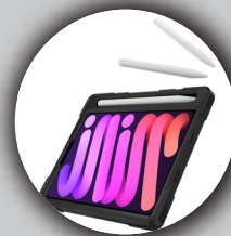
Integral Stylus Holder Design with Case