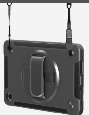
CARRY STRAP ADD-ON OPTION