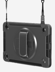
CARRY STRAP ADD-ON OPTION