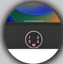
Digital Lock Anti-Theft Security