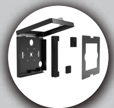
Interior Foam & Sheet for Tablet Compatibility