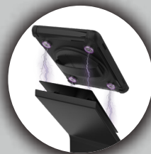
Strong Magnetic Mounting Connection

This combination premium locking floor stand and removeable magnetic case is ideal for presentations, conference rooms, lobbies, and any place that requires a secure iPad station. The rugged, military grade tablet case is splash-proof, impact-resistant, and comes with a screen protector. Powerful embedded magnets at its rear to enable instant mounting to metal surfaces – letting you switch from floor stand to refrigerator, or metal wall surfaces. The case is designed to allow full access to your tablet's ports, speakers, and home button. CTA's premium locking floor stand is a workhorse. Standing 50 inches tall, this heavy-duty floor stand boasts a hollow interior for clean charge cable routing, plus a weighted base equipped with slip and scratch resistant padding. The case is compatible with iPad 7th & 8th Gen 10.2", iPad Air 3 and 4, iPad Pro 10.5", and more.