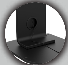
Efficient Cable Routing System