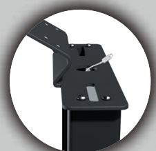
Built-in Cable Management