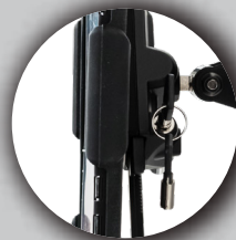
Lock & Key Security