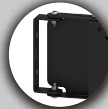
Mounts Flush to any Mullion