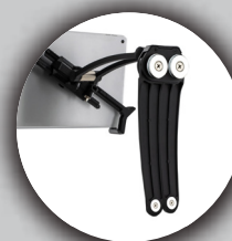
Magnetic Mount Option