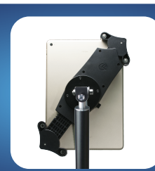
Adjustable Tablet Holder