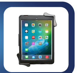
Holds Thick Cases