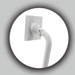
Flexible & Tilt Capable VESA Plate

limitless angle-adjustment and all of the mobility of