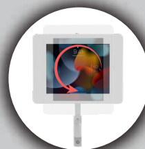
Portrait & Landscape