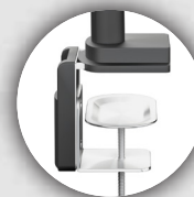
Sturdy C-Clamp Mount