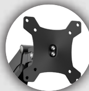
VESA Capable 75mm x 75mm 100mm x 100mm