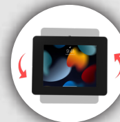
Portrait / Landscape Orientation