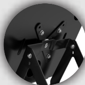
VESA 75x75 or 100x100 Compatibility