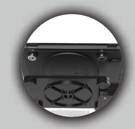
Quick Magnetic Mounting