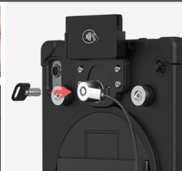
ANTI-THEFT DETERRENT SECURITY