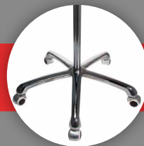
Durable Locking Casters