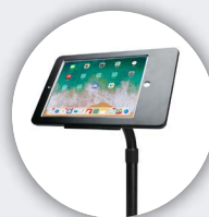
Vertical or Horizontal Viewing