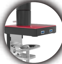
USB Ports at the Base