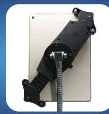
Adjustable Tablet Holder