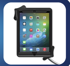
Holds Thick Cases