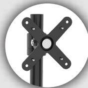
VESA 75x75 or 100x100 Compatibility