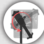
Portrait / Landscape Orientation