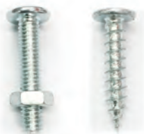
(2) Bolts with nut (2) Screws