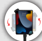
Portrait / Landscape Orientation