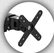
VESA 75x75 or 100x100 Compatibility