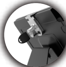
Anti-Theft Locking Security