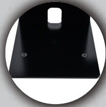
Heavy-Duty Steel Stand w/ Anchor Option