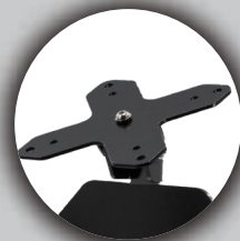
Flexible Universal VESA bracket