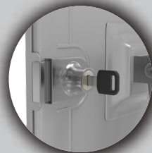
Lock & Key Security System