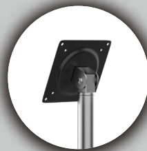
Versatile VESA mounting

CTA's popular Paragon Enclosures (PAD-PARAW). The VESA plate can be rotated for use in both portrait and landscape orientations. The included locking swivel casters attach effortlessly to the stand base, giving your stand smooth mobility in your office, home, classroom, or retail space.