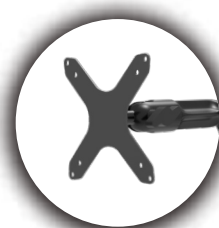
VESA Mounting Plate