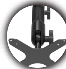
Omni-Directional Ball Socket