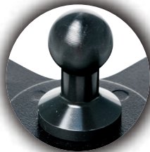
Omni-Directional Ball Socket