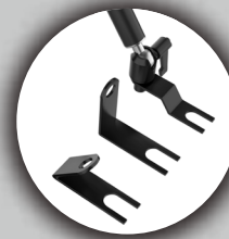
Flexible Footing Mount Options