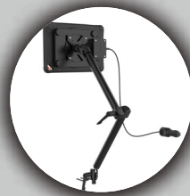
Vehicle Charging Kit