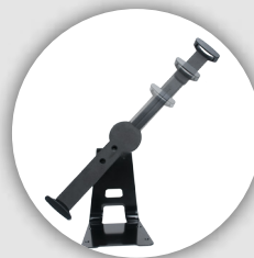
Adjustable holder designed for iPad Pro, Surface Pro 4 and other large tablets