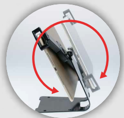
Tilts to quickly flip from front to back of stand for easy transactions