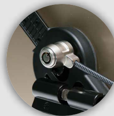
Lockable grip holder can be secured with included cable lock and keys